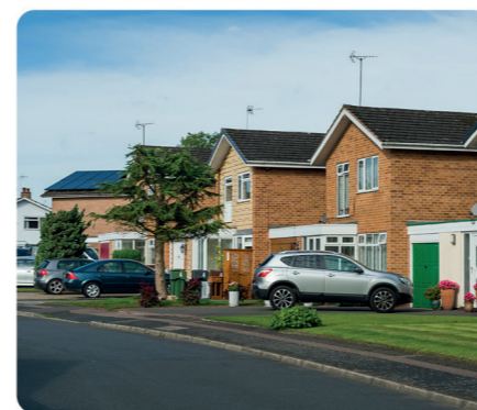
A street today.