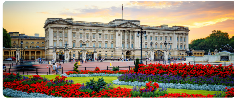
Buckingham Palace is in London, England. It is the Queen's main residence.

Royal residences include palaces, castles and stately homes. Some of them are used for official royal business and some are used as holiday or private homes.