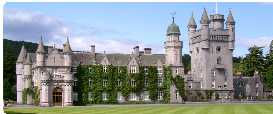
Balmoral Castle is in Aberdeenshire, Scotland. It is used mainly as a holiday home for the Royal Family.